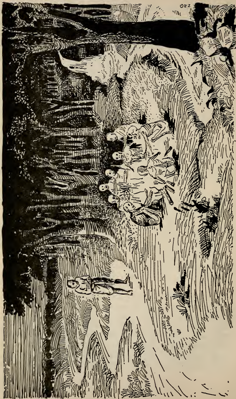
BANROO THE GHOST